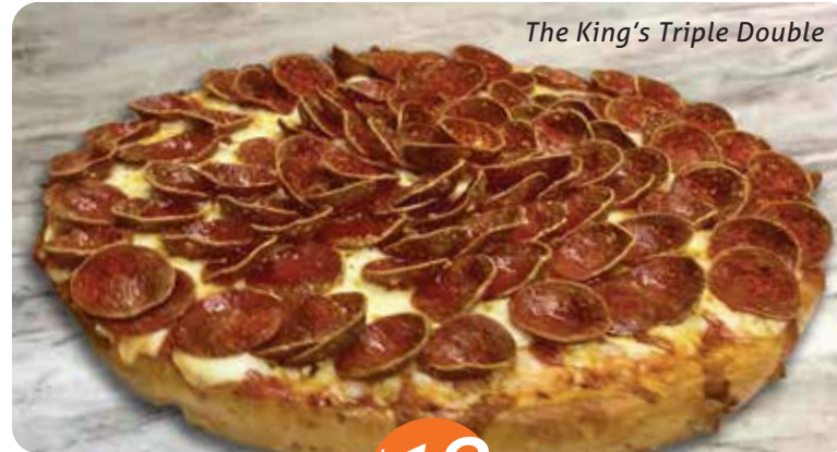
The King's Triple Double