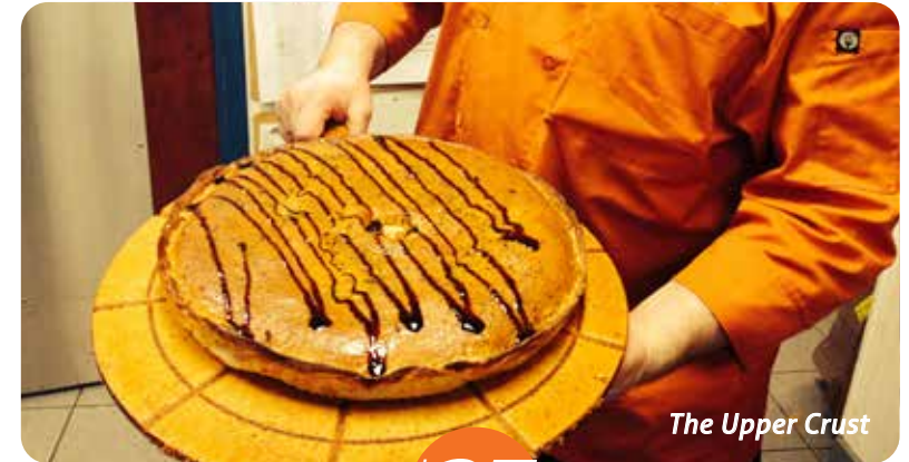
The Upper Crust