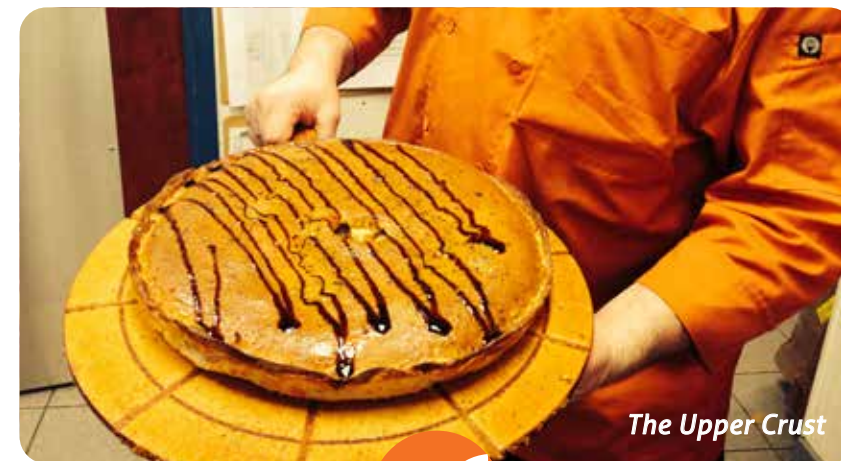
The Upper Crust