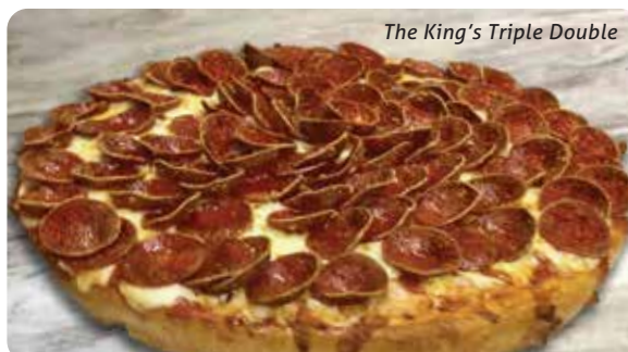
The King's Triple Double

AMERICAN PAN $18 • DETROIT CRUNCH $18 THIN & CRISPY $18 • GLUTEN-FRIENDLY $22 NEW YORK STYLE $23 • HALF SHEET $27